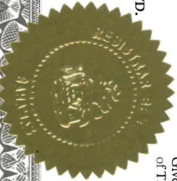
Acting Registrar General

Given under my hand and seal at Nassau in the Commonwealth of The Bahamas this 26th day of February, 2016